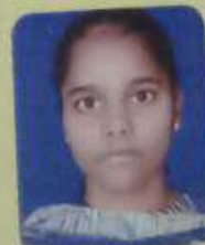
SYB Com Sem III 3rd place