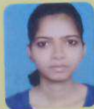
FYB Com Sem I - 1st place and Sem II - 2nd place