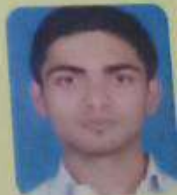
SYB Com Sem I 3rd place