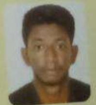
SYB Com Sem III 1st place