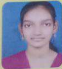
FYB Com Sem I 3rd place