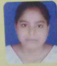
FYB Com Sem II 1st place