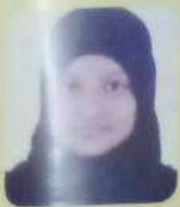
Com Sem I - 2nd place and Sem II - 3rd place