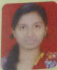
SYB Com Sem III & IV 2nd place