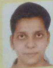
SYB Com Sem IV 1st place